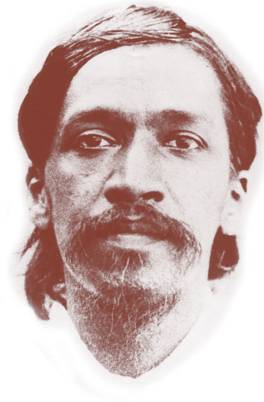
Sri Aurobindo in Alipore Jail, 1908