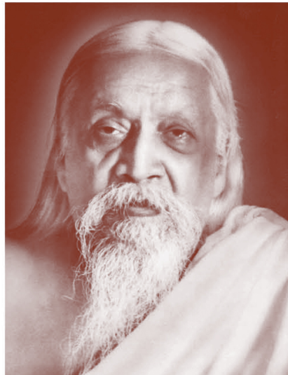
Sri Aurobindo, 1950

Sri Aurobindo was a prominent nationalist leader of the freedom movement in India. It's not a coincidence that on 15th August 1947, on his 75th birth anniversary, India attained independence. Sri Aurobindo gave this message at the request of All India Radio, Tiruchirapalli, for broadcast on the eve of India's independence. On this historic occasion, Sri Aurobindo gave his vision of a new India and the role it had to play in the future. It has been 75 years since Sri Aurobindo shared the five dreams that he had worked for, and which he now saw on the way to fulfilment. The realisation of these dreams would mark the beginning of a new age, not only for India but for the entire world. Indeed, his message to India and the world is as relevant today and continues to support us and calls us to work for the realisation of his five dreams.